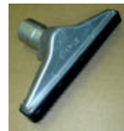
CTO3818 CTO5018 FLOOR BRUSH