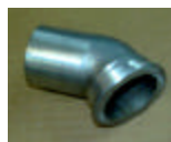
CTO3820 CTO5020 SWIVEL ELBOW