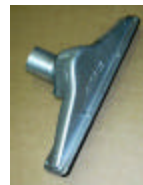
CTO3817 CTO5017 METAL FLOOR