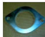
CTO3821 CTO5021 SWIVEL ELBOW FLANGE