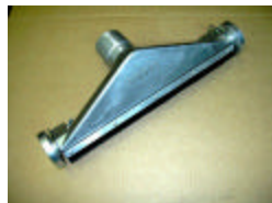
CTO3816 CTO5016 ROLLER FLOOR