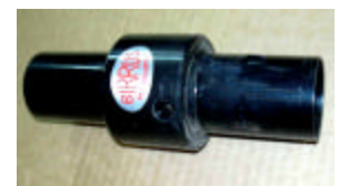
CTO5025 SWIVEL JOINER 50 mm ONLY